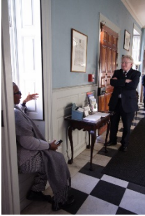
Governors helped staff the Holiday party.