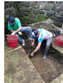
October 2018. Excavations were conducted in the rear courtyard.

The Shirley Place property was subject to its first systematic archaeological excavations in October 2018, conducted by public volunteers from Boston’s City Archaeology Program under the direction of Joe Bagley. It was hoped that the dig would help answer questions as to the precise location of the Mansion before it was moved in the 19 th century and the material lifestyle and diet of its residents from all periods. The dig focused on the paved courtyard near the staff entrance, an area to be slated to eventually be disturbed by a re-surfacing project.