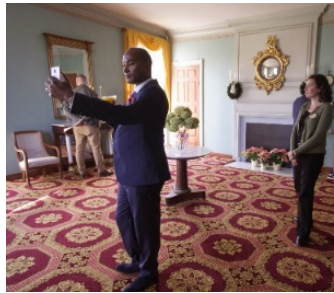
Holiday party guests explored the Drawing Room.