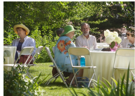
July 15 th A Summer Garden Party was held in collaboration with Old South Meetinghouse.