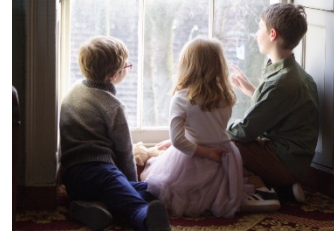
Our youngest guests met and mingled.