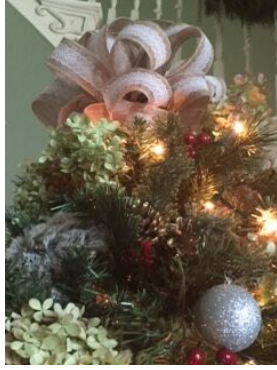
Dahlia's Garden features locally grown flowers and foliage in their designs.