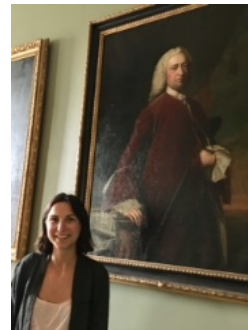
A Shirley descendant visited from England in September.