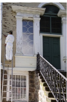
Painters from 2W Painting Inc. prepped the Mansion's Garden entrance.

The Buildings and Grounds Committee also worked closely with the Finance and Budget Committee to develop a list of priority exterior repairs. It is hoped that repairs, including ones to the Carriage House roof and the gazebo as well as replacement of rear patio paving and several important gates and fences, can soon be funded through donations and grants. Interior projects including ceiling repair and paint touch up have also been identified as high priorities.