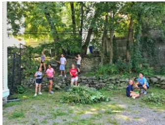
Tufts University FOCUS students. In late August incoming Freshmen helped clean and organize the Carriage House and weed its gardens.