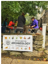
Public Volunteers from Boston’s City Archaeology Program.