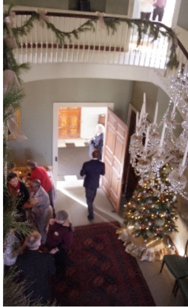
View of the Great Hall from a balcony.