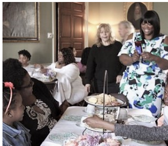
The Events Committee served guests at the Mother-Daughter tea.