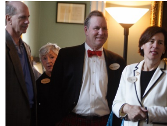
Holiday Party.