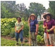
Massachusetts Master Gardener Association Volunteers

SEHA is a small organization, with limited operating funds, a small staff and very complex needs. In order to successfully fulfill its challenging mission it relies heavily on a deeply committed Working Board, active Overseers and devoted volunteers, members, donors and trusted vendors. Collectively, Governors, Overseers and Volunteers contributed over 3,100 hours of service to SEHA in 2018. Some, along with guests and visitors who enjoyed Shirley Place in 2018, appear in the following photographs.