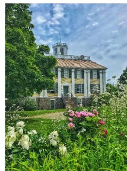
Shirley Place 2018