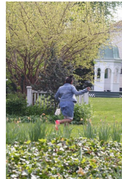
A child found delight skipping through our grounds following the Mother-Daughter Tea.